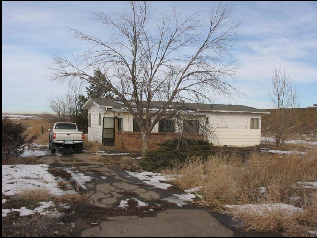
Looking north from County Road 6 toward site and improvements