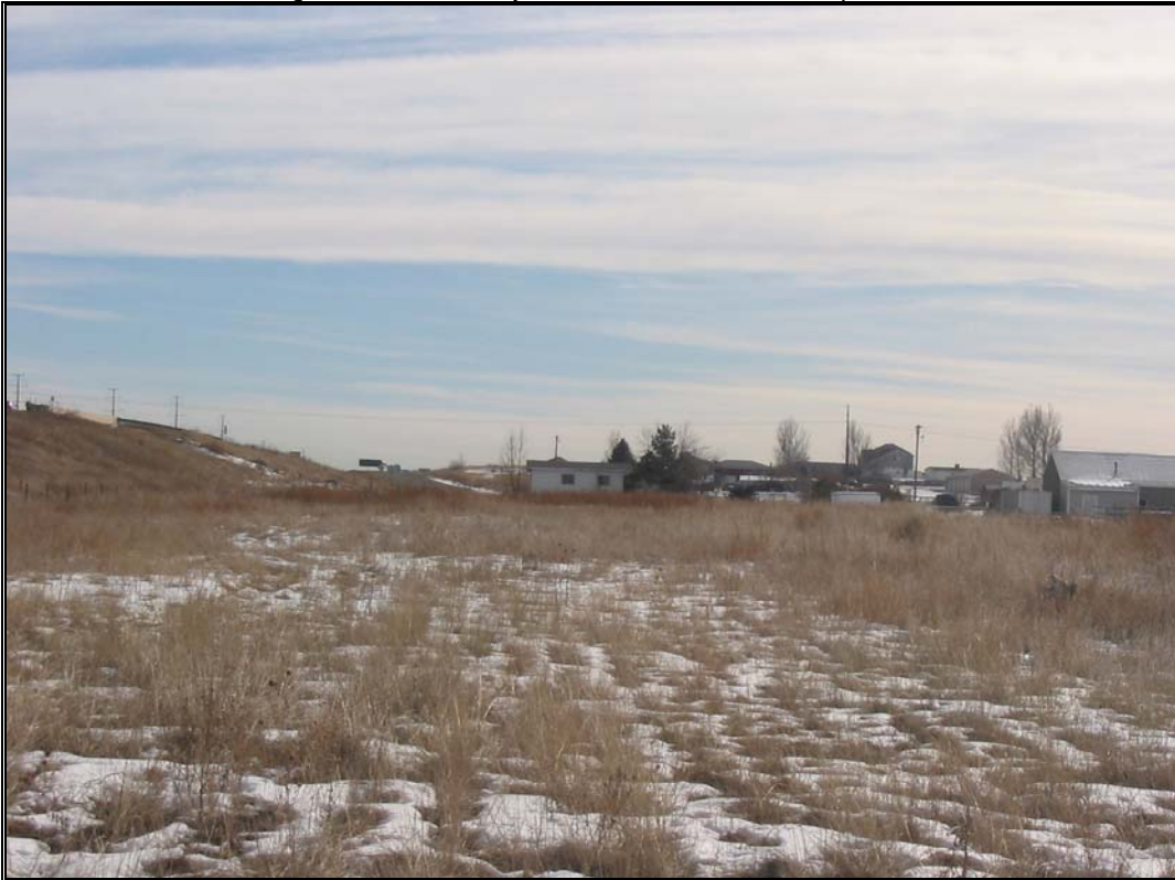
Looking south from northern area of the property toward County Road 6