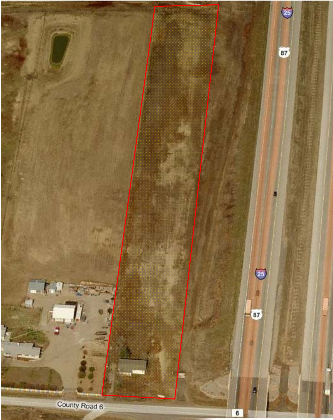
Approximation of subject area high-lighted in red